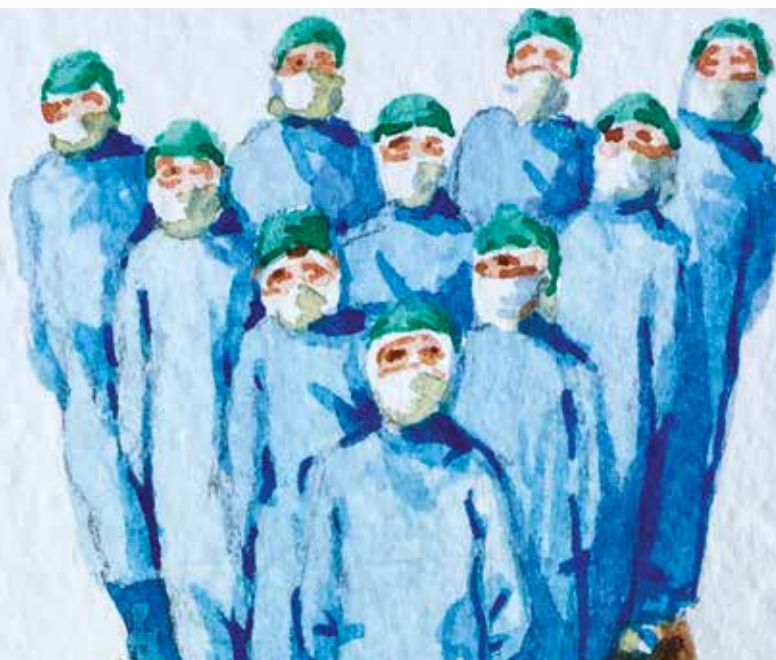
© Yanni Cuoghi, 2020, "Without title and in silence", watercolor on paper